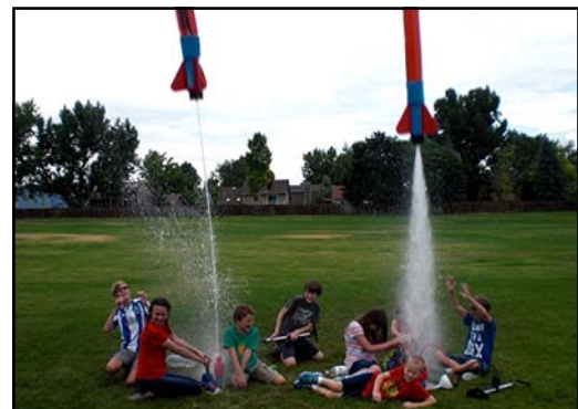
We Have Joy! A Double Rocket Launch.