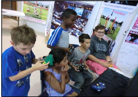
Crew Working Together, and Having Fun!!

Specific objectives for each program are given to the students at the beginning of the program week. Instructors and Camp Counselors assist, guide, and monitor progress of each student, signing off requirements upon completion. When all objectives are complete, an instructor formally recommends the student for recognition of completion of that level. At an awards ceremony, a Space Flight Medal of Honor is presented. Space Voyage Summer Camp is designed for every student to achieve.