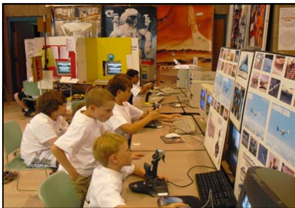
Cadets Using Space Voyage Flight Decks