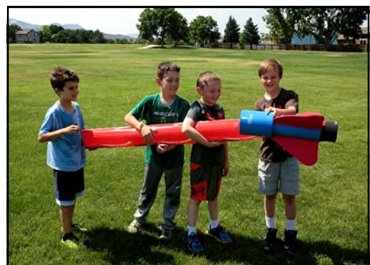
Cadets and Pathfinders in Rocket Recovery.