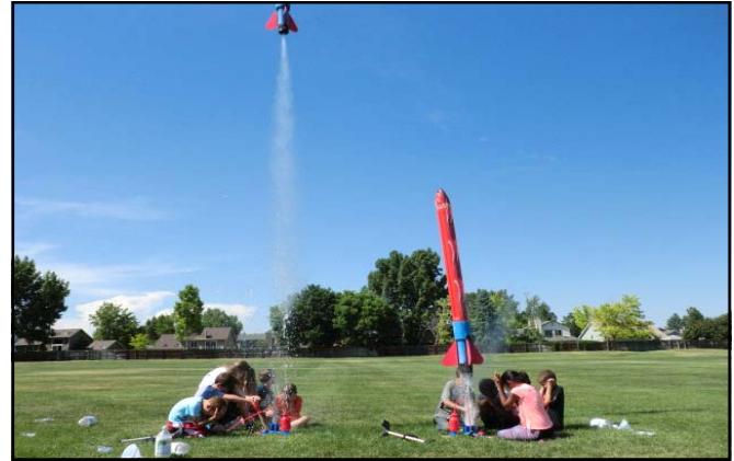
Pathfinders and cadets launching air-water rockets at camp. We have both indoor and outdoor rocket systems.

Pathfinder is able to earn their own Space Flight Medal of Honor. Requirements are process based and include: Do your best; Ask questions; Tell the instructors what you need; and Work as a team when asked. Pathfinders work with the Program Director to create a unique mission crew patch which is used as a new notebook cover, wall art and other ways during their week at camp.