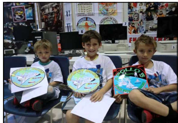
Pathfinders Sharing Crew Mission Patches and Medals.