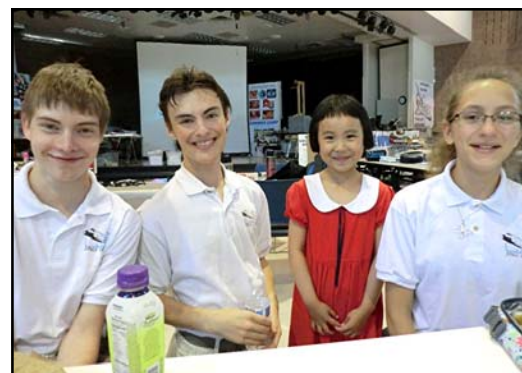
Making New Friends at Space Voyage

© Copyright 2017. Space Voyage. All Rights Reserved. www.SpaceVoyage.com