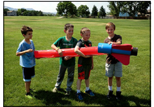
Cadets and Pathfinders in Rocket Recovery.