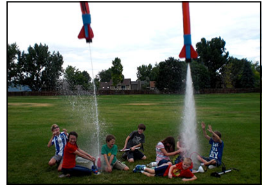
We Have Joy! A Double Rocket Launch.