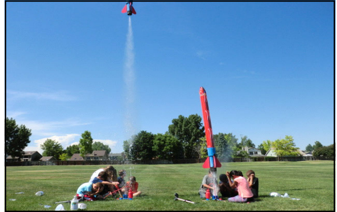
Pathfinders and cadets launching air-water rockets at camp. We have both indoor and outdoor rocket systems.

Pathfinder is able to earn their own Space Flight Medal of Honor. Requirements are process based and include: Do your best; Ask questions; Tell the instructors what you need; and Work as a team when asked. Pathfinders work with the Program Director to create a unique mission crew patch which is used as a new notebook cover, wall art and in other ways during their week at camp.