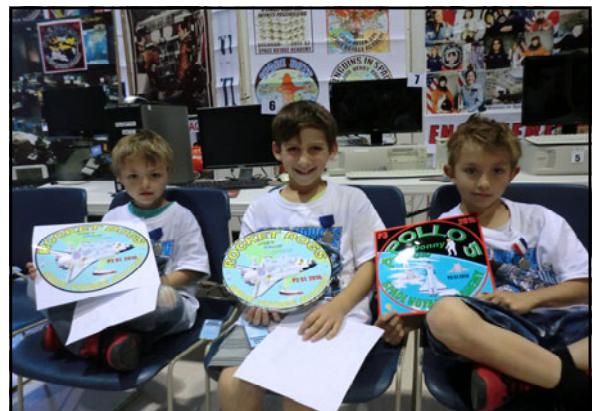
Pathfinders Sharing Crew Mission Patches and Medals.