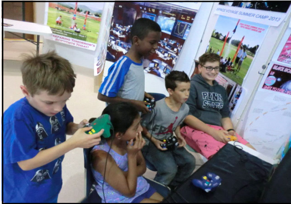
Crew Working Together, and Having Fun!!

Specific objectives for each program are given to the students at the beginning of the program week. Instructors and Camp Counselors assist, guide, and monitor progress of each student, signing off requirements upon completion. When all objectives are complete, an instructor formally recommends the student for recognition of completion of that level. At an awards ceremony, a Space Flight Medal of Honor is presented. Space Voyage Summer Camp is designed for every student to achieve.