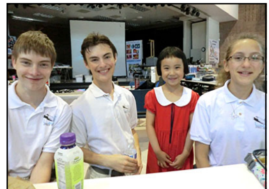
Making New Friends at Space Voyage

© Copyright 2018. Space Voyage. All Rights Reserved. www.SpaceVoyage.com