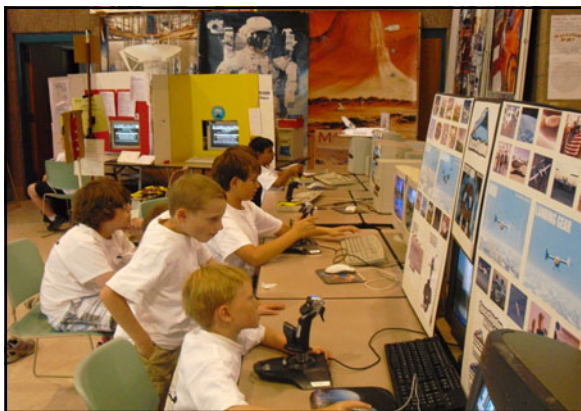
Cadets Using Space Voyage Flight Decks