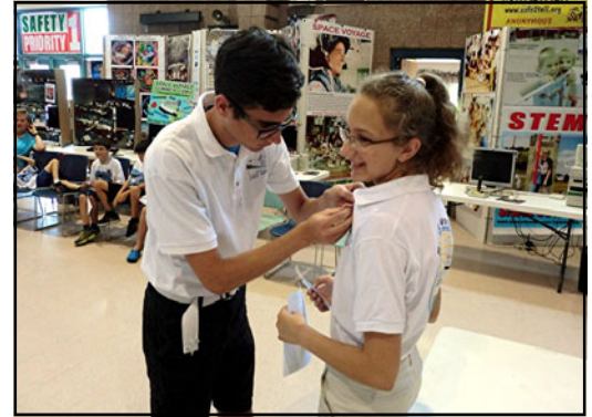
Receiving a Space Voyage Medal of Achievement.

Students arrive between 7:30 and 8:00am, Morning program runs 8 to 11:15am; Lunch from 11:15-11:45am; Afternoon program runs 11:45am to 3:30pm. After hours care until 4:00pm. Students must be picked up by 4:00pm.